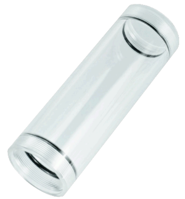
120 mm XL Sight Glass